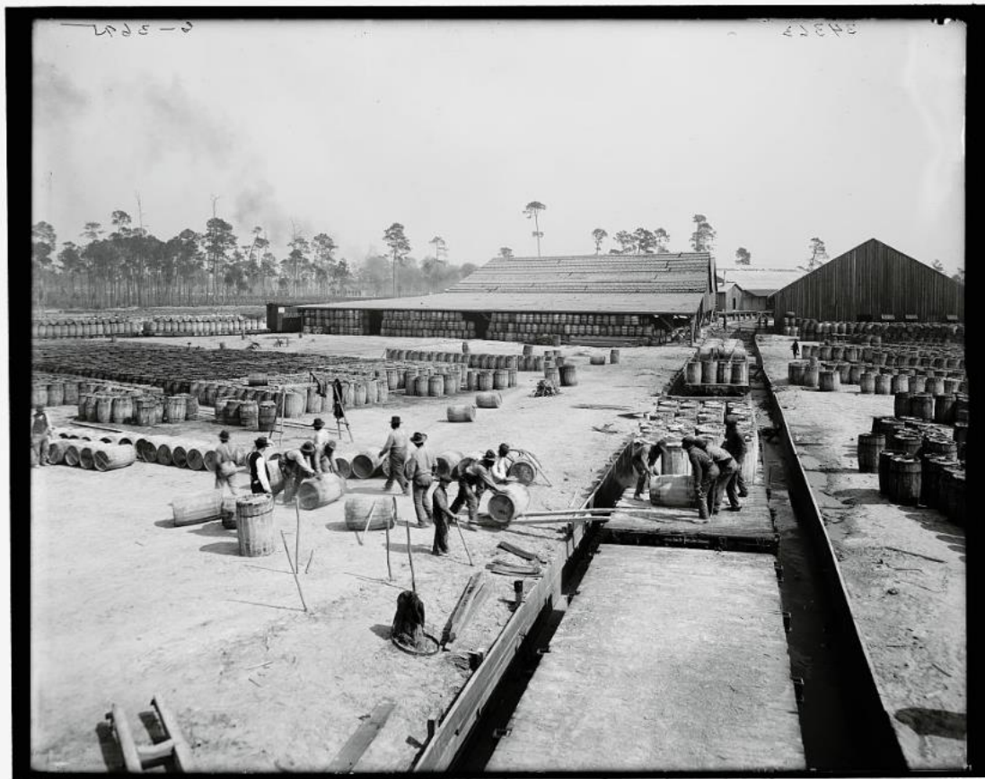
N.O. New Orleans? naval supply yard, Gulfport, Mississippi. United States Mississippi Gulfport, None. [Between 1900 and 1910] [Photograph]