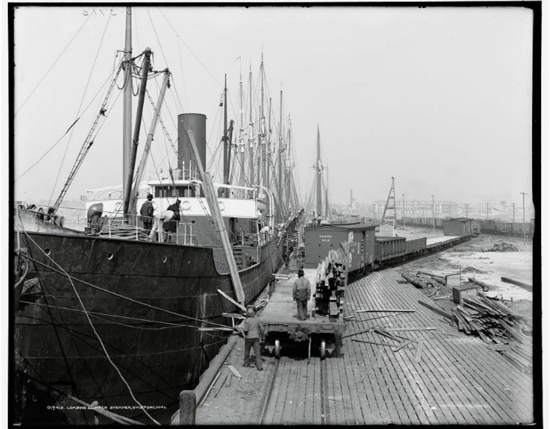
(ca. 1906) Loading lumber steamer, Gulfport, Miss. United States Mississippi Gulfport, ca. 1906. [Photograph]