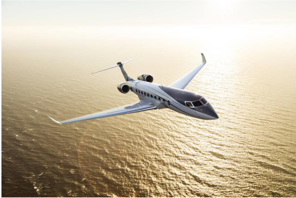
GENERAL DYNAMICS OVERVIEW